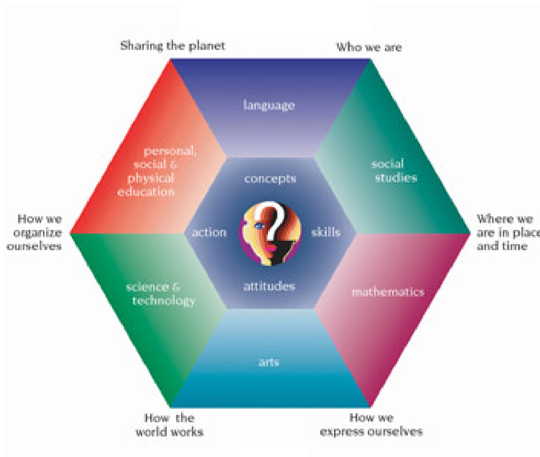
Curriculum model showing the inter-related CBC areas and PYP approach.